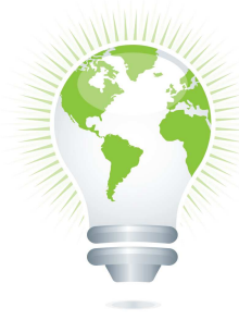
“April 22—Celebrate Earth Day!”

Demonstrate the creative side of ordinary objects. Make a recycled flower pot. Cut-off the bottom of a 2 liter soda bottle, decorate it, and plant seeds. Tour each part of the house and talk about which products are recyclable or able to be reused.