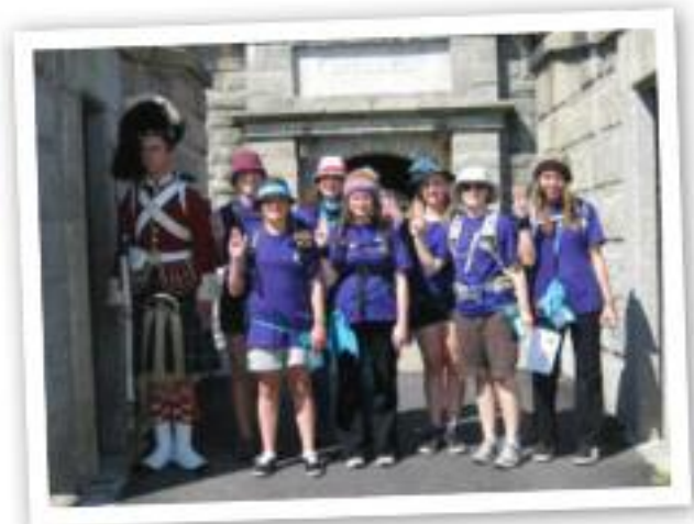
It was great to see the attractions and culture of Nova Scotia.

bridge (ours held 12 people!), and building catapults (the girls' catapult threw a sponge 55 feet!)