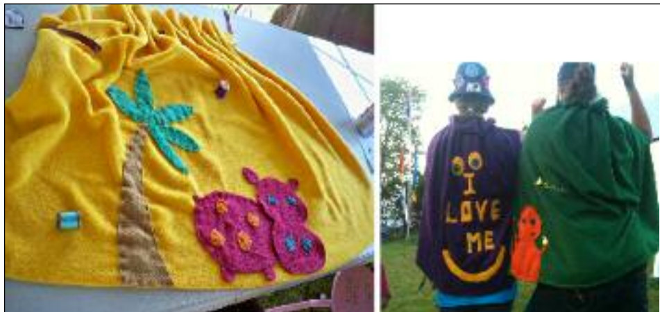
Our Super Hero fleece capes were made and then donated to a Women's shelter.

With camp numbers about 300 with staff, and patrols