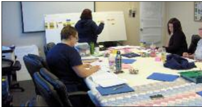
Finance (above) and Safe Guide (below) training.

Send in your request for training topics to Roberta Fehr: robfehr@telusplanet.net