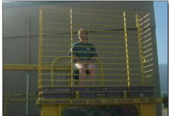
The girls dug deep in their pockets to make a donation to CWFF to dunk me at the county fair.

As we were enjoying the Country Fair before closing ceremonies I thought I would pull a fast one on the girls. There were a couple of times when they weren't prepared during the week. I challenged the girls if they could come up with money for CWFF they could dunk me in the dunk tank. I was sure no one had any money as the fair was free. Boy was I shocked when they came up with 2 fists full of change. They learnt their lesson to be prepared.