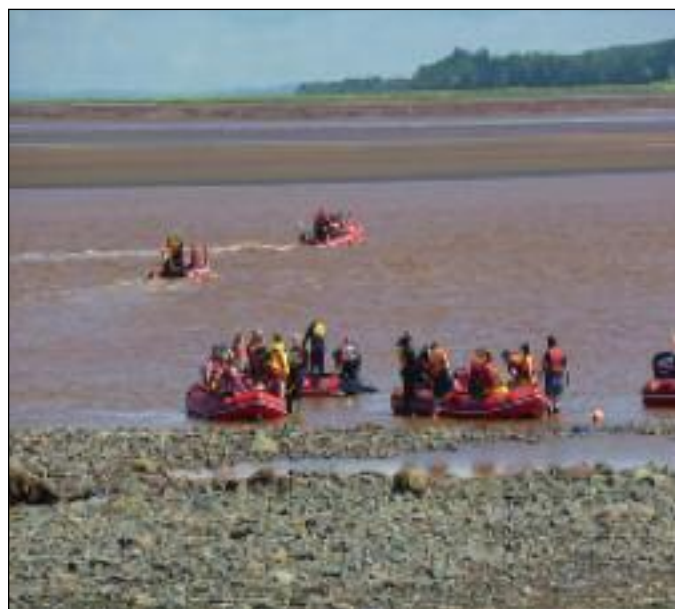
Tidal bore rafting at the Shubenacadie River.

from New Zealand (3 young ladies) England (about 100 participants) and from across Canada everyone had a wonderful time. The weather was great, the food awesome, and the new friendships made were immeasurable.