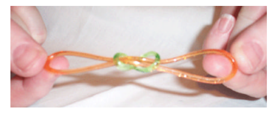
Step Four: Bend both rounded ends of the bracelet to the centre of the figure eight made by the ring.

Step Three: Pull the folded end of the bracelet across the ring and pass it down through the other opening.