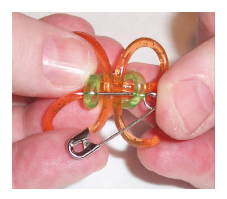
Step Six: Turn over and adjust so that there are two larger loops, or wings, with two smaller ones below them

Step Five: Open the pin and put it through the first loop of the ring, over top of the two rings formed by folding the bracelet to the centre, and through the last loop of the ring.